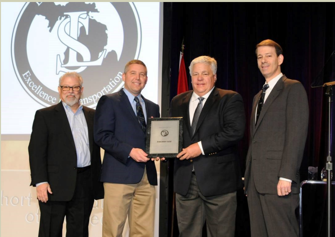
2018—LSRC awarded Short Line of the Year by Railway Age