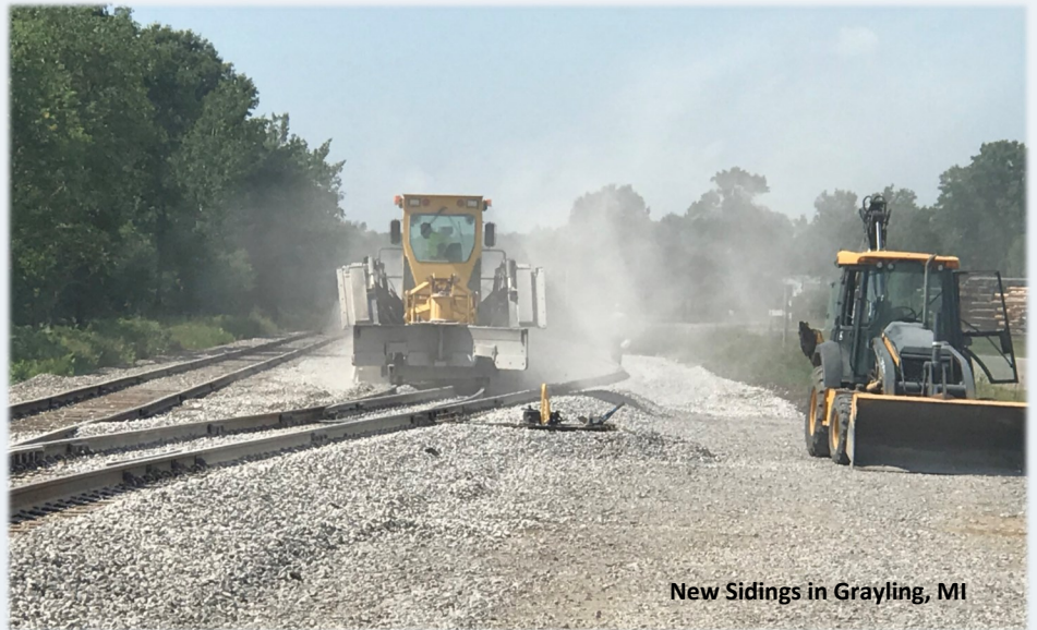
New Sidings in Grayling, MI

entire workforce doing their jobs with purpose and pride in an effort to make a difference. We're looking forward to our future together as a company.